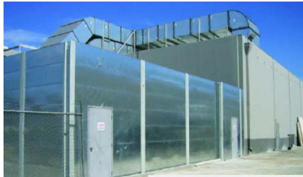
Sound Wall used to control outdoor noise

We suggest using acoustic steel sound panels to help abate the noise from a Hammer Mill. Either a sound wall or a full sound enclosure can be engineered around the high decibel Hammer Mill. This acoustic noise control approach can help lower the noise levels at the property line caused by this noisy grinder machine.